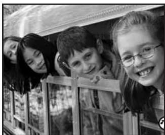
Saving for college can begin with relatively small amounts of money.

(NAPS)-The first thing any parent hoping to send their child to college should do is not let the latest news headlines panic them. Sure, the federal government now faces what might kindly be called a "cash crunch," but assuming you were counting on Washington for financial aid, that mostly means you need to stay more alert than ever to any changes in programs meant to encourage higher education. And especially if your child is still young. . .well, remember the main thing you've got on your side is time.