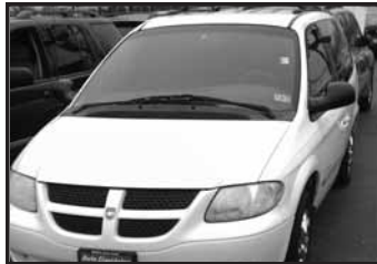
01 Dodge Caravan