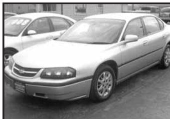
05 Chevy Impala