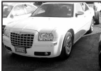
06 Chrysler 300