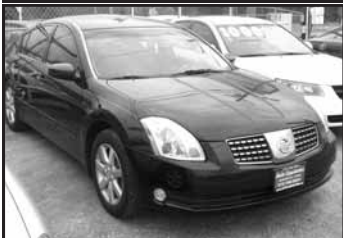
05 Nissan Altima