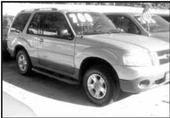
02 Ford Explorer