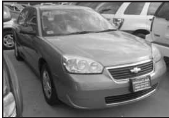
07 Chevy Malibu