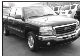
06 GMC Sierra