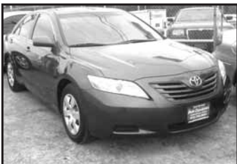
07 Toyota Camry

GOOD CREDIT • BAD CREDIT • NO CREDIT • YOUR JOB IS YOUR CREDIT