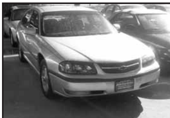
02 Chevy Impala