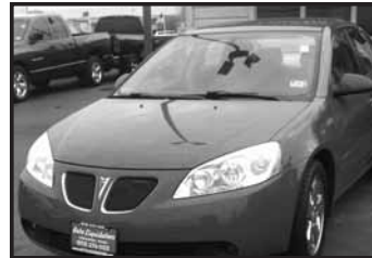
06 Pontiac G6 GT

1995 LEXUS ES- 300: sunroof, leather, fully loaded, 139k miles, $3500 cash. (214)542-8985.