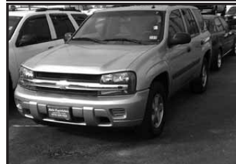
05 Chevy Trailblazer